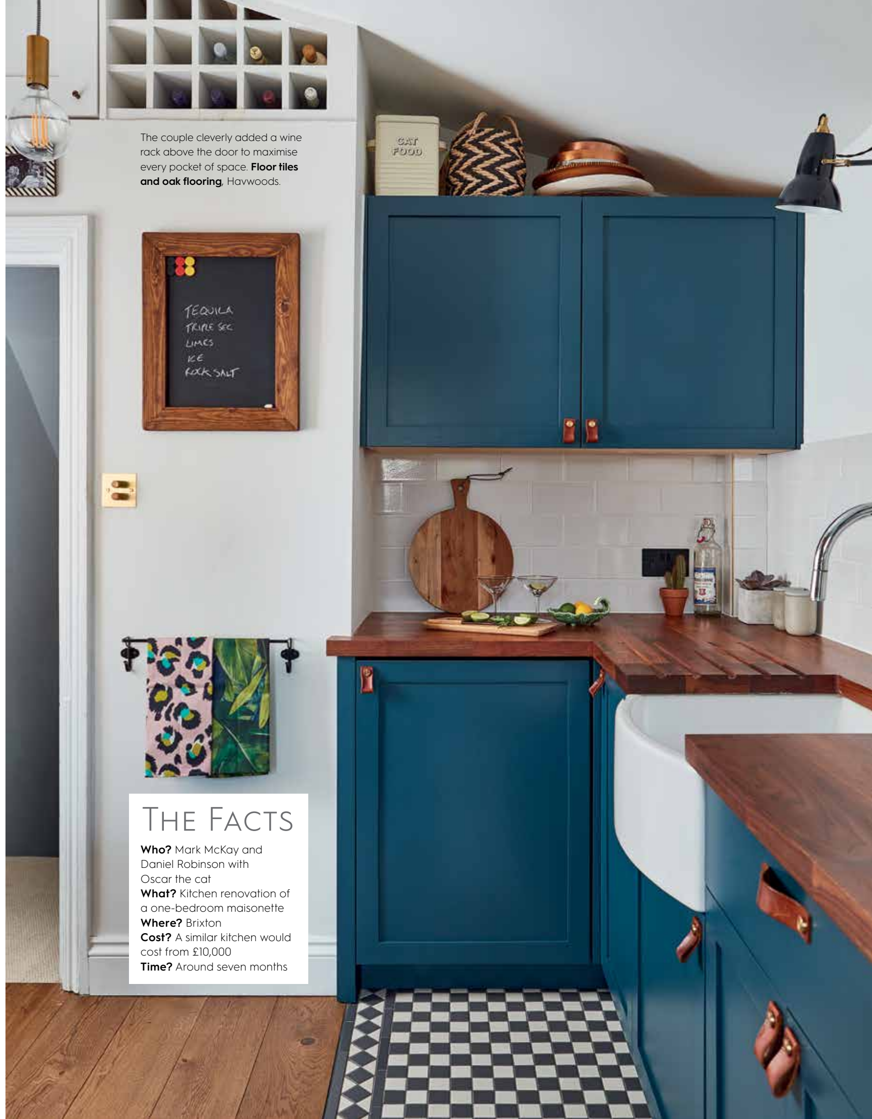
The couple cleverly added a wine rack above the door to maximise every pocket of space. Floor tiles and oak flooring , Havwoods.